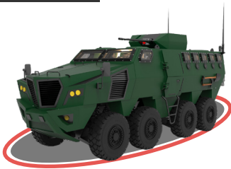
HAMZA 8X8 MCV