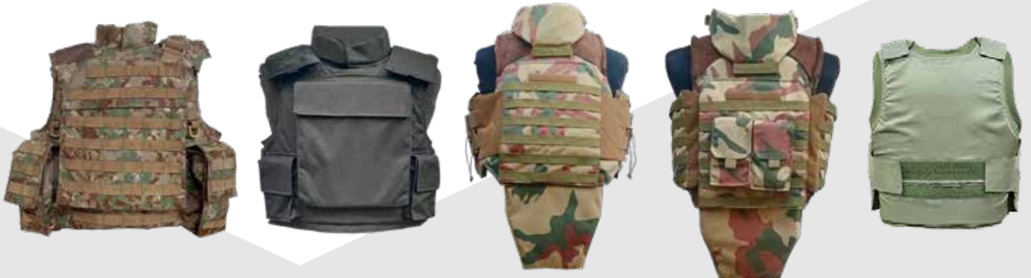
OTV-NA-BP / EP