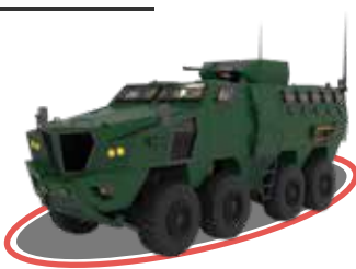
HAMZA 8X8 MCV